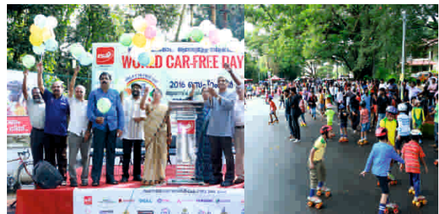
World Car Free Day Celebration at Thrissur