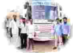
Tulasi FPCCL BODs