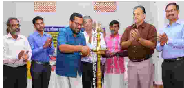
Inauguration of Urjakiran Program