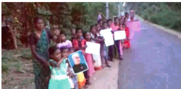
Children's day celebration at Nagpur

Children's Day was celebrated across the centers in Kerala and Nagpur on Nov 14. Various programs and activities were organized for the day including painting competition.