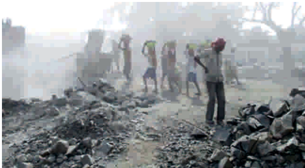
Stone quarry workers in Jharkhand