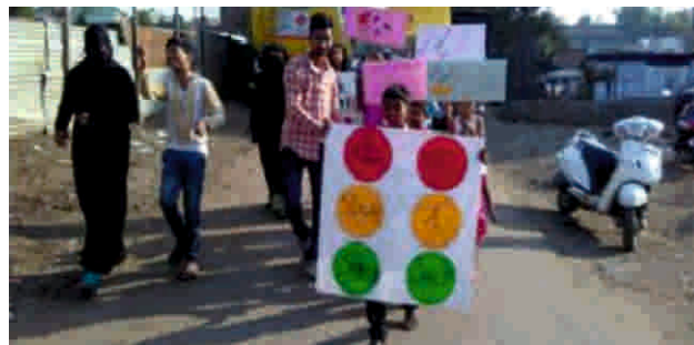
Road safety week observation - Nagpur

creating awareness. 40 children and community members have participated in the program.