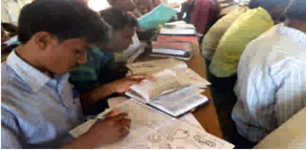
Capacity building of teachers