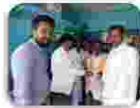
Purchase of Pesticide by BODs