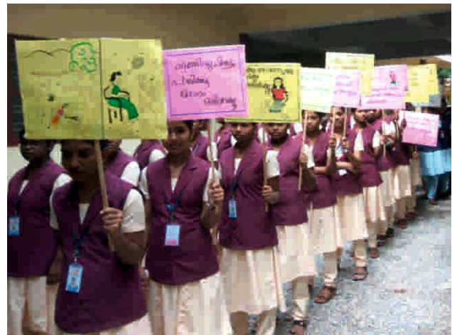
Community health awareness programme