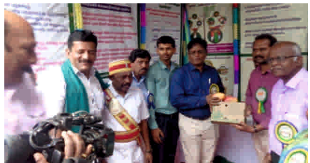
World Soil Day observed by Krishnagiri Mango Producers Company Ltd on 5th December, Chief Guest: District Collector.