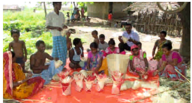
Livelihood training - Bamboo crafts

Stitching training was conducted for two SHG's in Langopahari village. The training duration was for 30 days. Bamboo craft training programs were held in the villages of Latakandar and Nimpahari. 30 men attended the 15-day training program. LED light making training was conducted for the two communities in Jharkhand and for the people in Aturia village, West Bengal. This was a new skill for the community people. Training in tailoring, sweet making and packing also were conducted among the communities. People are responding positively to these kinds of new training as it requires less investment and gives more profit.