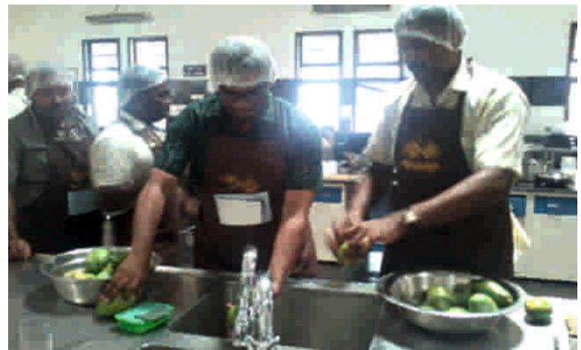
Exposure visit to IICPT by Muthalamada Mango Farmers Producer Company, Palakkad, Kerala