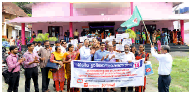
Urjakiran Rally flag hoisting

Executive Director – ESAF talked about various projects and programs being implemented by ESAF on Energy conservation. Local panchayath authorities and more than 500 people attended the rallies.