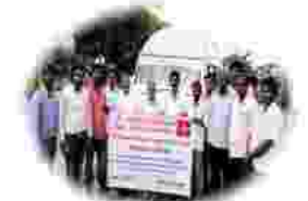
Haridwarana FPCCL BODs