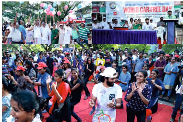
World Car Free Day Celebration at Kochi