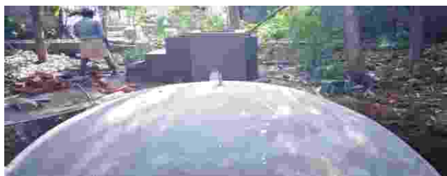
Biogas Plant installed at CF Hoapital, Ottanchathram

ESAF has been conducting awareness programs and training sessions for the Self Help Groups to build awareness on green energy products like solar lantern, cook stove and water purifiers. Many families started using the products as a result of various awareness and training programs.