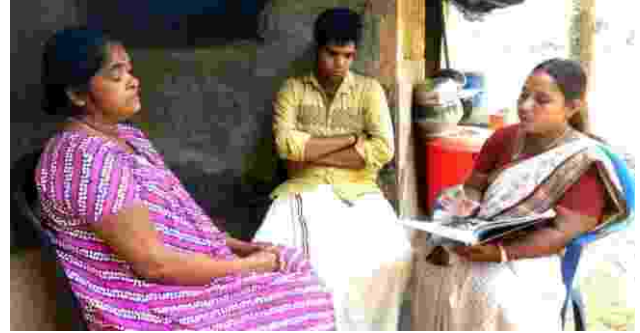
Arogyamithra staff at work

counseling too. Last year, they have covered 1136 house visits and 34 clients with mental issues were identified and 19 were referred to mental health services.