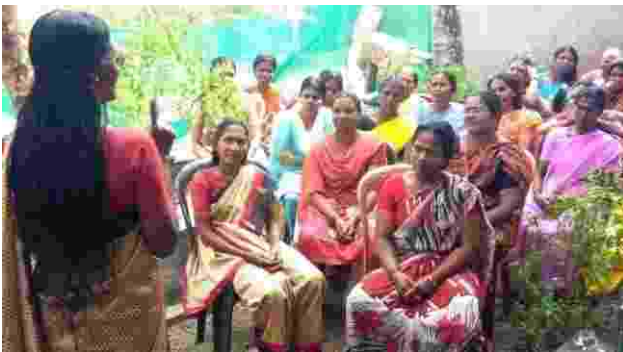
Group Sensitization Meeting

Group Sensitization Meetings (GSM) are a vital part of the Arogyamithra project. The Arogyamithra health workers covered 188 sangams and 1586 clients through GSMs during the pilot phase. During the sensitization session the health workers covered the topics of NCDs and mental health among a group of 25 to 40 clients per group. On an average each Arogyamithra health worker reached 103 clients in a month through GSMs.