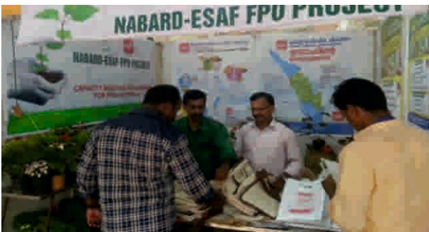
ESAF participated in the exhibition VAIGAFAIR conducted by Govt. of Kerala in Thiruvanthapuram on 2nd, December, 2016