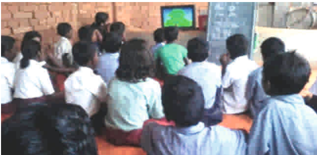
Education through battery operated TV

In keeping with our vision to provide 'world class education to the tribal children, ESAF initiated to get them acquainted with computers. Field coordinators who were provided with laptops led the task. They also carry battery-operated television sets to the centers and programs related