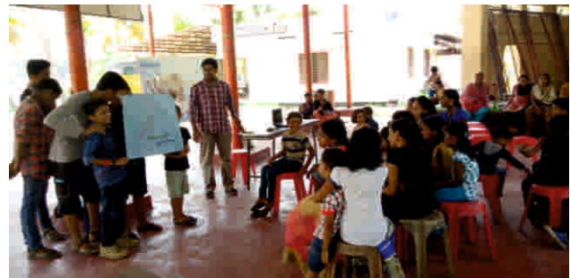
Training in Addition Awareness Programme