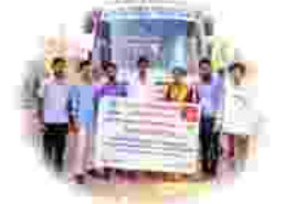
Iggalur FPCCL BODs