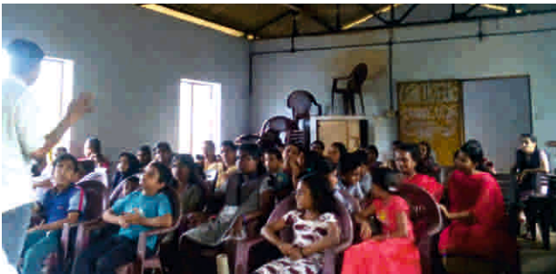
Child Rights Awareness Program

An awareness program for children and parents was conducted by Childline at Areekode CTH. The major topics discussed were increasing rate of child abuse happening in the society and the importance of parents being aware on the issues faced by children. Around 70 participants have attended the program. After the program, the officials from Childline visited the houses and counseled the parents and the children.