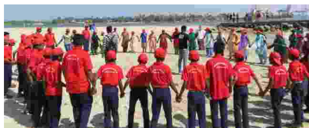
Beach for all campaign

ESAF had initiated a "Beach for All" campaign at Fort Kochi on 11th January 2017 with the objective of redesigning the beaches as public spaces and to advocate for making beaches functional, safe and inclusive. The intention is to make the beaches available for everyone including the differently-abled and the elderly. The participants for these campaigns were children with special needs, transgenders and elderly men and women in the respective community. As a result, four Grama Panchayath's have decided to redesign the beaches in their area, into safe and accessible public spaces.