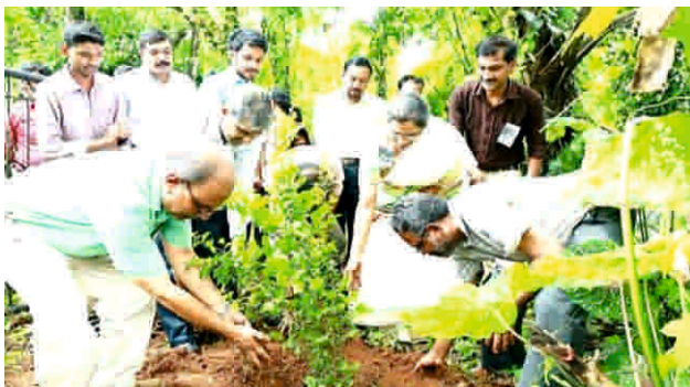
Planting fruit tree saplings

World Environment Day was observed on 5th June 2016 and the theme for the same was "illegal trade in wildlife". The environment day was organized across different ESAF branches and more than