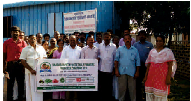
Visit to IICPT (Indian Institute of Crop Processing Technology)

Visit to IICPT (Indian Institute of Crop Processing Technology) helped the BODs to understand and adopt value addition techniques and preparation of bankable business plans.