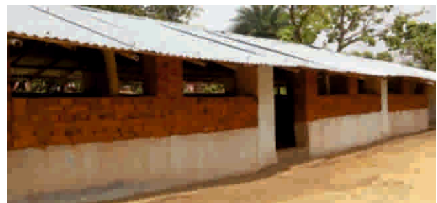
Community schools with tin sheet roofing