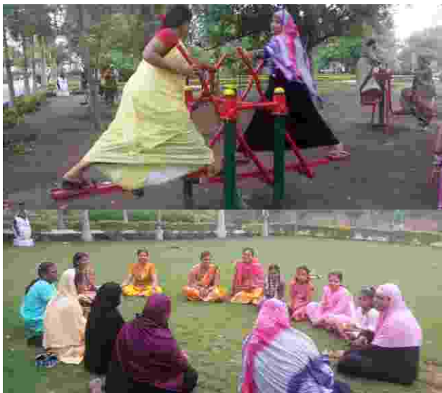
Park Programme - Nagpur

Parks program in Nagpur is aimed at encouraging women and children in using public spaces and thereby helping them to spend quality time with the family. This year Livable cities team formed four walking clubs in four parks and many new members have joined the club. ESAF in partnership with Institute of Architect, Nagpur developed a play space which won the runner up award in the Westminster Design competition for transforming 100 public spaces in South Asia. Observation of International Women's Day and World Disability Day in parks highlighted the importance of parks as a public space and has received support from the city administration.