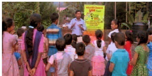
Child Rights awareness Program

ESAF organized Child Rights Observation Week in association with Childline, through different Community Transformation Hubs across the state from November 14 to November 20. Local Self