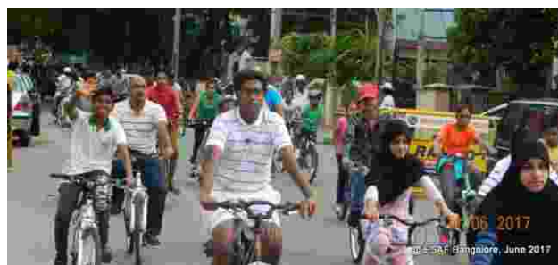
Cycle Day - Bengaluru

Cycle Day in Bangalore has now become a popular choice for many people on Sundays. The main objective of the program is to promote active transportation and lifestyle habits among neighborhoods. ESAF, the core organizing member of Bengaluru Coalition for Open Streets (BCOS) has conducted 111 cycle days in the city of which three communities have gone ahead with Neighborhood Improvement Plans for promoting sustainable transport, cycling and pedestrian infrastructure. These projects have received the nod from the city administration, BBMP and are currently in the implementing stage.