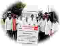
Lakkondahalli FPCCL BODs