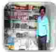
Outlet at Hosur