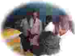
Cattle feed shop