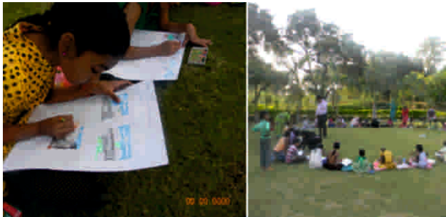
Art & Craft workshop - Nagpur

develop the creative and artistic skills of children. 40 children and facilitators have participated in the program.